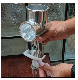
1. Attach covers to clamp.