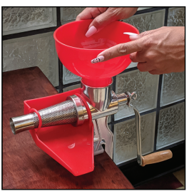
9. Insert bowl and twist to lock to the top of the housing.