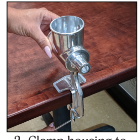
2. Clamp housing to a table.