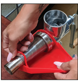
8. Attach tray under screen.