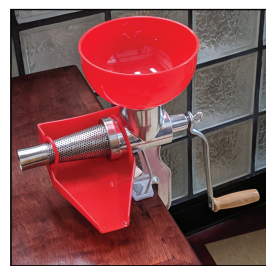
10. Ready to use and process your favorite fruit or vegetable.