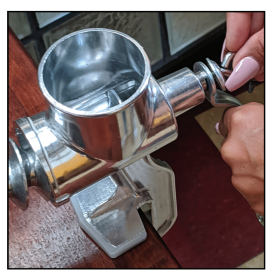
5. Attach handle to the rear with handle wing nut & plate.