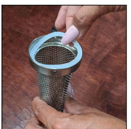
6. Insert nylon gasket into screen.