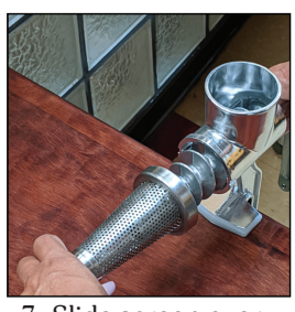
7. Slide screen over scroll and twist to lock in place.